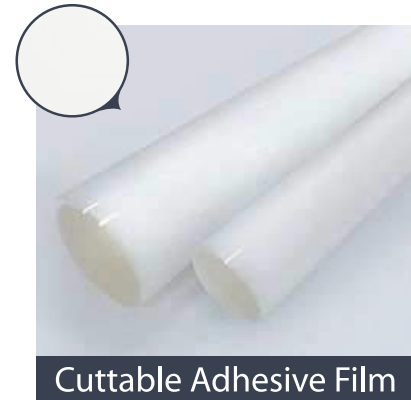
Cuttable Adhesive Film

Temperature : 155°C ~ 160°C Time : 1st. 5~7sec ( Adhesive Film ) 2nd. 10~12sec ( Stamping Foil )