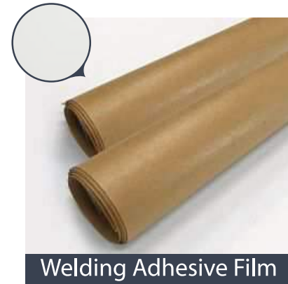
Welding Adhesive Film